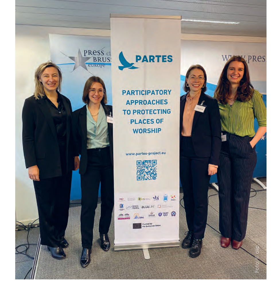
PARTES EU Workshop in Brussels, April 2024

Yhile a number of communities have beefed up their security concepts, in part supported by national authorities, protective measures in and around places of worship remain inadequate, making them vulnerable to surprise attacks and serious incidents."