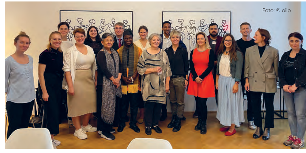
Intercultural Achievement Award October 2023

In December 2011, the Austrian ALF members elected the Austrian Institute for International Affairs (oiip) as Head of Network (HoN). Since then, the most important aspect of our work is to support and strengthen the intellectual, cultural and civil society exchange of the Austrian member organizations. In 2023, we organized a joint