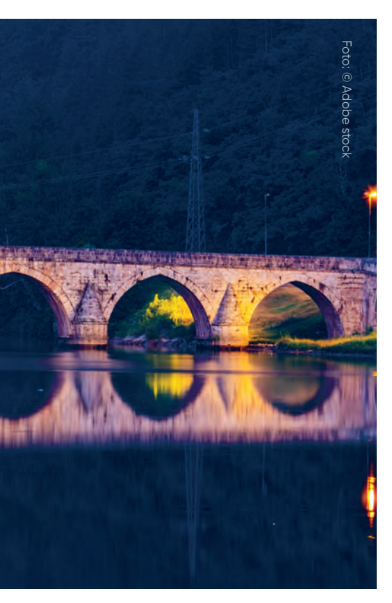
The bridge over the Drina, Višegrad, Bosnia and Herzegovina.

The Russian aggression against Ukraine has injected a very much-needed sense of urgency into EU enlargement."